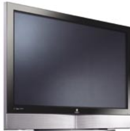
Vizio's P50HDM 50" plasma monitor

Toshiba and Canon each displayed an SED (Surface-conduction Electron-emitter Display) panel, approximately 37” diagonal, claimed to be 1280 × 768; in a dark room. In each case, the image looked OK, with solid blacks and strongly saturated colors, but showed a faint cloud of white, like light-leakage, around the white letters on a black background. There was no fast motion in the program, so the presence of motion artifacts could not be determined. The quality of the image can also be attributed to the source material. The strength of the colors might have been too high, but without knowing the program, it is not possible to be sure.