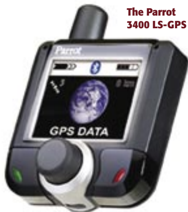
The Parrot 3400 LS-GPS

Parrot ( www.parrot.biz ) exhibited automotive bluetooth devices that link to cell phone products, a GPS that integrates with cell phones, and an in-dash MP3/CD receiver (which also communicates with cell phones).