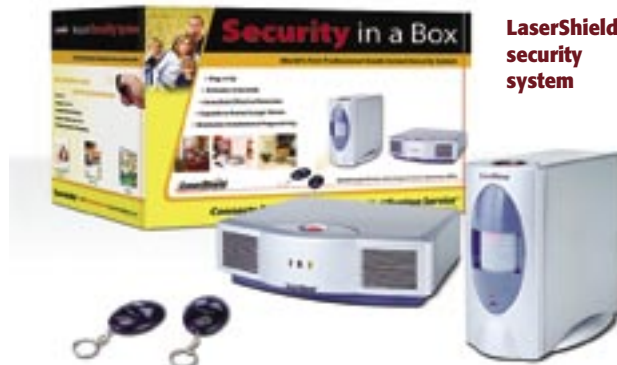
LaserShield security system

All this expensive equipment in your home and car needs protection. LaserShield ( www.LaserShield.net ) offers "Security in a Box" ($200 srp), a plug-n-go (no installation) wireless security system for home or car that includes infra-red motion detection, sounds an alarm, and with service activation ($20/month) can call a security monitor when triggered. Additional